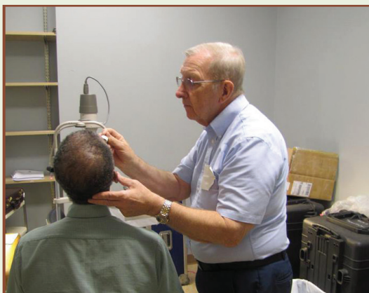
Remote Area Medical (RAM) provides eye exams and glasses on a monthly basis at VMC.