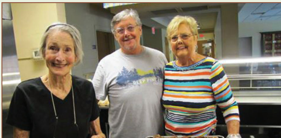
Members of St. James Episcopal Church prepare a delicious meal for the VMC Resource Center.